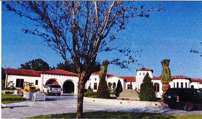
FRONT VIEW 07-06-2016

If using the Elevation Certificate to obtain NFIP flood insurance, affix at least 2 building photographs below according to the instructions for Item A6. Identify all photographs with date taken; "Front View" and "Rear View"; and, if required, "Right Side View" and "Left Side View." When applicable, photographs must show the foundation with representative examples of the flood openings or vents, as indicated in Section A8. If submitting more photographs than will fit on this page, use the Continuation Page.