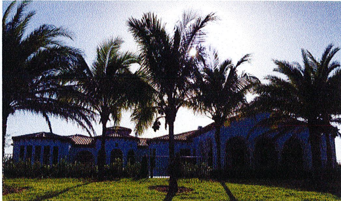
REAR VIEW 07-06-2016