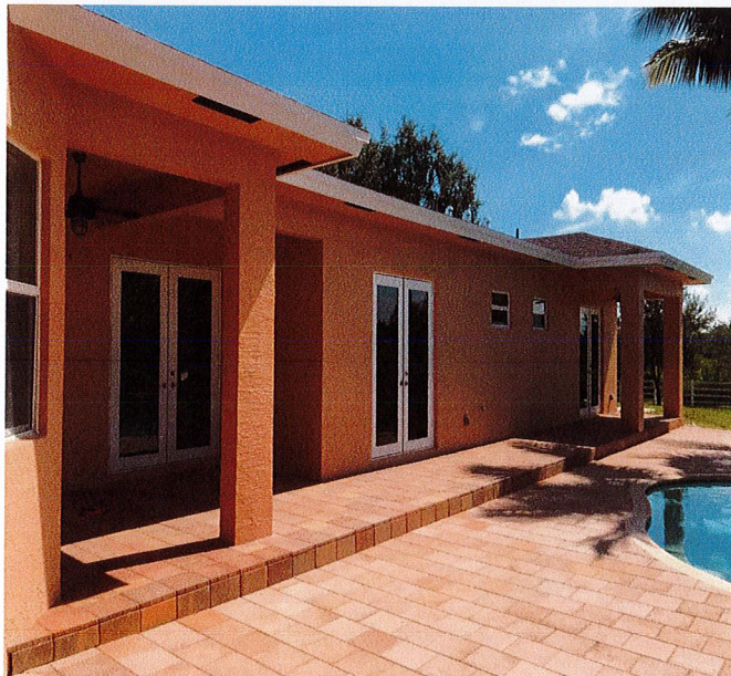
North View 08-15-2019